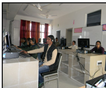
Students at LINUX Workshop

ken Tutorials, (audio lectures) provided by IIT Bombay were then listened to by the students to familiarize them with LUNIX. Passing an online exam, conducted remotely from IIT Bombay was a prerequisite for completing the workshop. The date of online Examination was fixed for April 12, 2012. The passing students will be awarded a certificate by IIT Bombay.